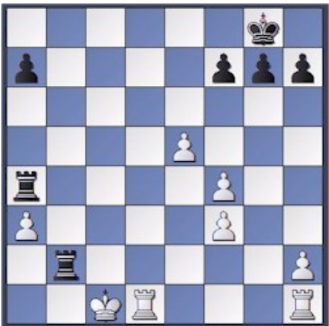
After 24. 0-0-0!