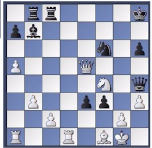
After 35. Nf4