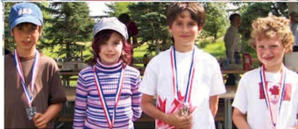
Hermitage Chess and Picnic on July 17 Section C Above Section B Below

Elementary School Team Match #2 Friday evening, December 2 - Jr./Sr. High Only Tournament at ECC Sunday, December 11 - Scholastic Christmas Tournament at ECC Saturday Morning, December 31 - End of 2011