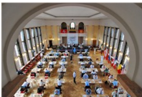
Competitors in the tournament hall.