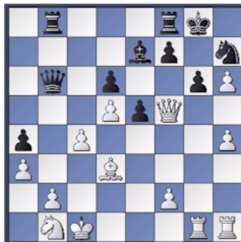
After 27. Qf5

Black's only saving resource. The deceptively similar 28...Bg5 fails because of an impending mate on g7. 28...Bg5? 29.Rxg5 Nxxg5 30.Qf6!