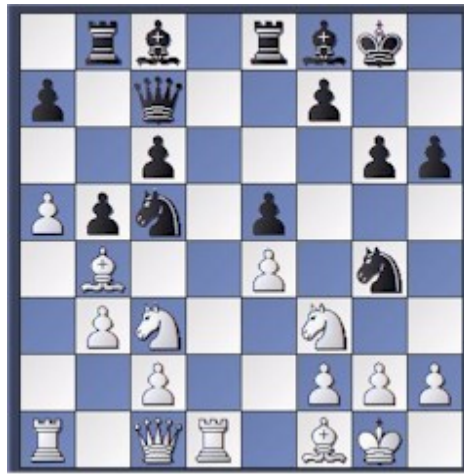
After 18. Bb4

We both worked out that 18...Nxb3 19.cxb3 Bxb4 20.Nd5 Qd6 21.Nxb4 Qxb4 22.h3 Nf6 23.Qxc6 just leads to an equal position. Shaba had a big clock edge out of