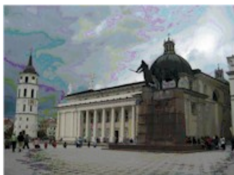
War Museum in Kaunas] Vilnius Cathedral, in the Historic City Center of Vilnius (Capital of Lithuania)

Left: Gas mask for dogs. Right: The Armoured Assault Train. Though not particularly effective a weapon, it is credited with having helped win a battle in 1918, due to causing a boost in soldier morale on arrival. [pictures taken from the