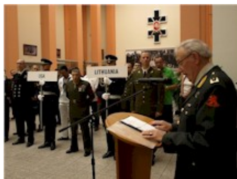
General Steffers addressing the participants at the opening ceremonies.