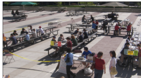
Sir Winston Churchill Square in Edmonton was site of junior tournament in June and will be used again for a major outdoor event for all ages in late August.