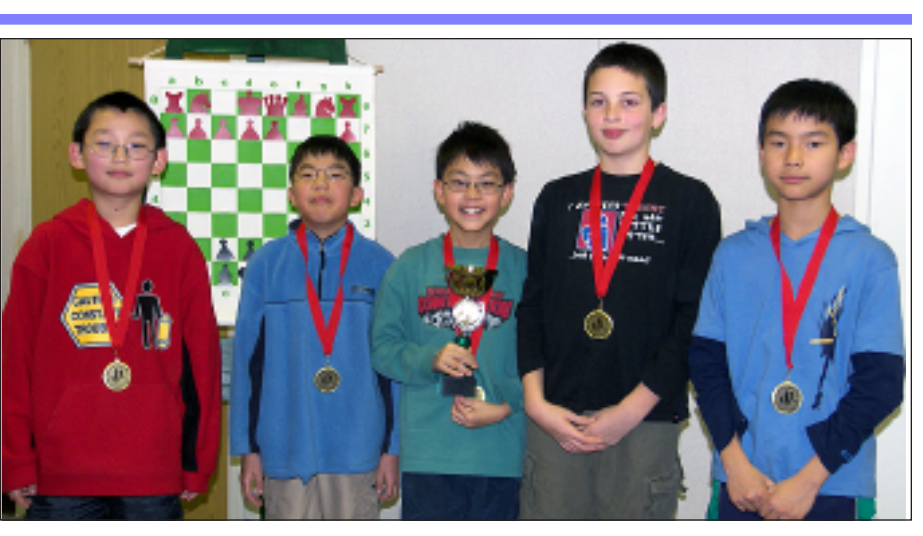
Westbrook Elementary's winning A Team - see Chatter Page 2

INSIDE: North wins First Junior Battle of Alberta West Edmonton Mall to host Scholastic Teams