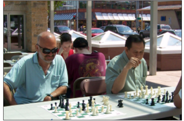
Casual players enjoy some sunshine and chess at Edmonton's Winston Churchill Square.