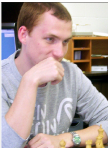
GM Valeriy Aveskulov

[Date "2007.08.05"] [White "IM Donaldson, John"] [Black "FM Huber, Gregory"] [WhiteElo "2413"] [BlackElo "2211"] [Round "7"] [Result "1/2-1/2"] [ECO "A04"] 1. Nf3 c5 2. c4 Nf6 3. Nc3 e6 4. e3 b6 5. d4 cxd4 6. exd4 Bb4 7. Bd3 O-O 8. O-O Bb7 9. Bg5 h6 10. Bh4 Be7 11. Re1 d6 12. Bc2 Nbd7 13. Qd3 Re8 14. Rad1 1/2-1/2