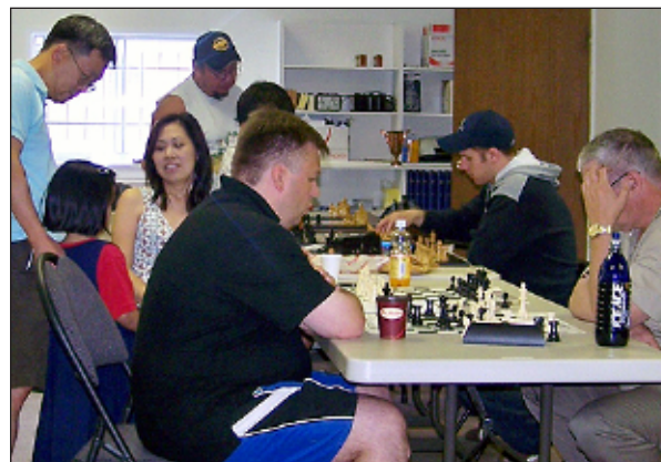
Edmonton Chess Club's skittles area is usually a beehive of activity for spectators and players.

Junior Chess News/Notices in this Issue: Chatter in the Castle