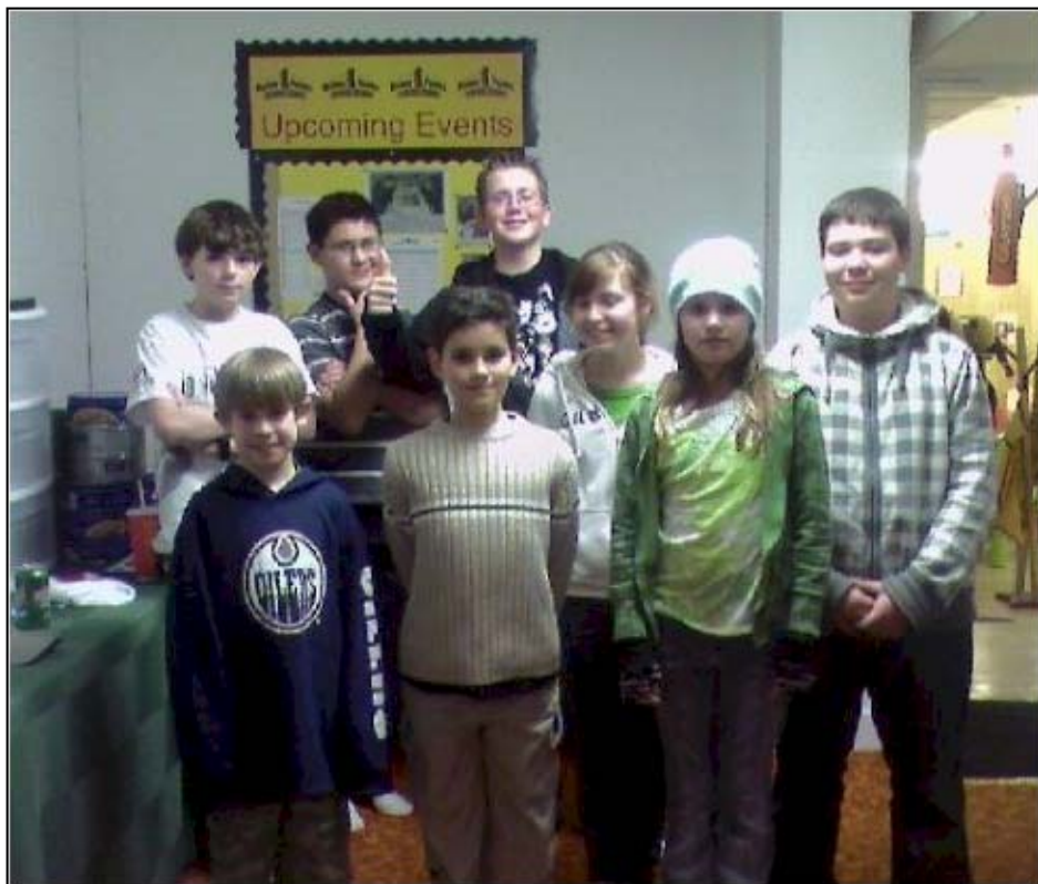
The participants of the 2009 Trumpeter Classic Junior tournament