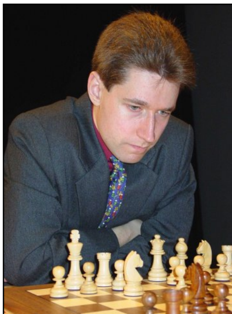
GM Michael Adams