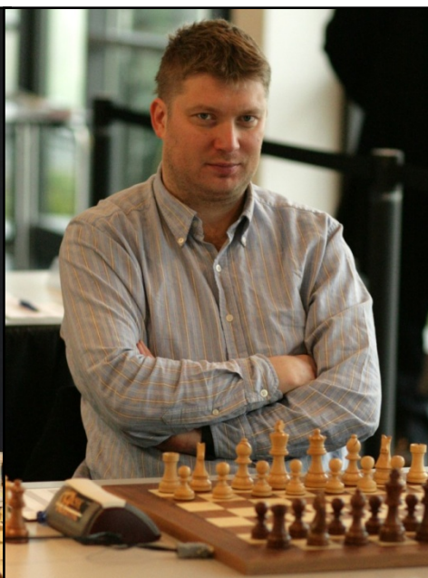
GM Alexei Shirov